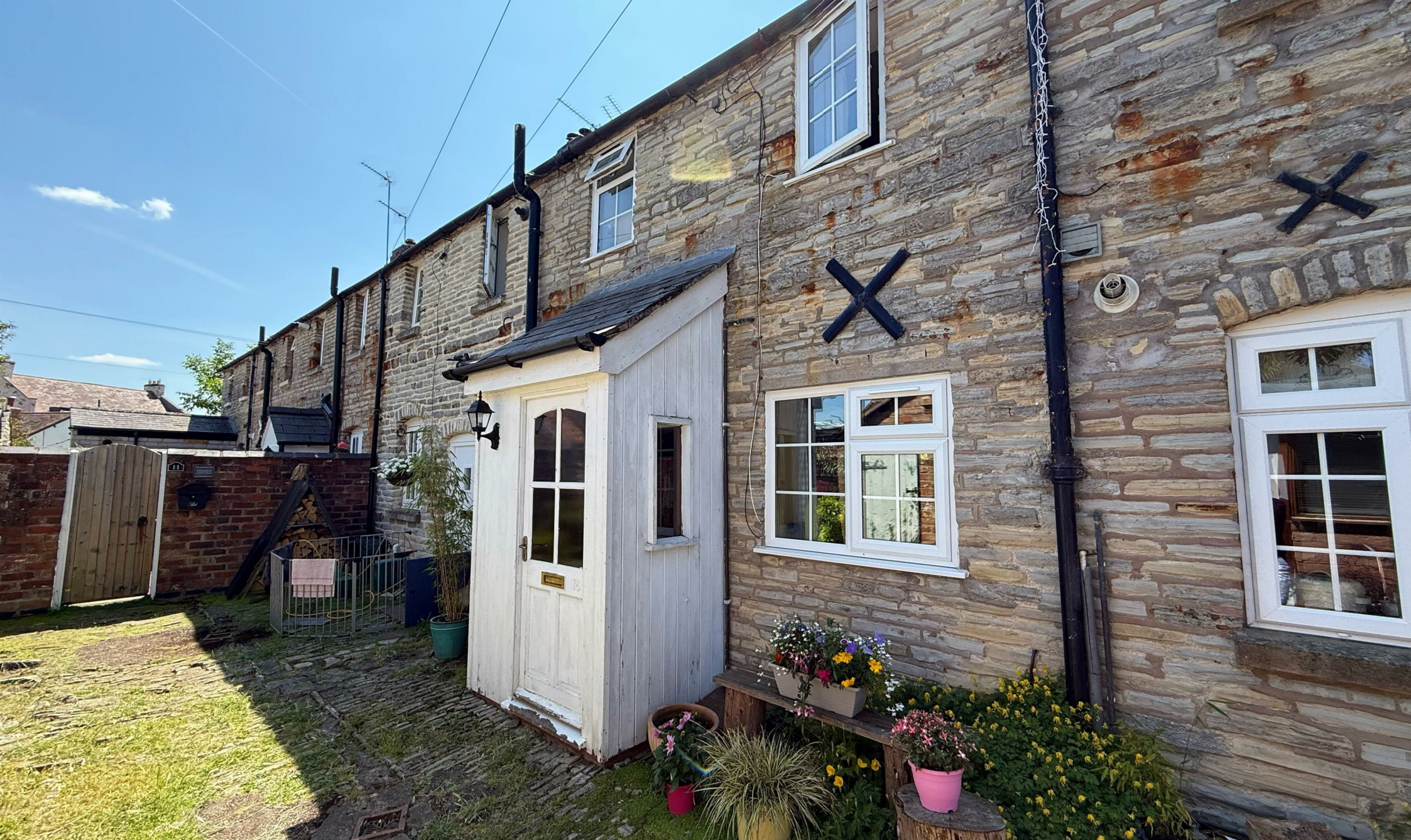
Aston Cantlow Road , Wilmcote Stratford upon Avon, CV37 9XN